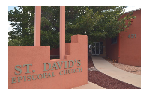
St. David's Episcopal Church occupies and operates upon the ancestral and traditional lands of the Hopi and Navajo people.

"No matter who you are or where you are on life's journey, you are welcome at St. David's."