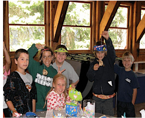
Camp Tuttle Summer 2011

The deadline for registration for the "Day" is May 12. The program will take place on Saturday, May 21 from 8:30 a.m. - 4:00 p.m. at the Episcopal Church Center of Utah, 75 South 200 East, Salt Lake City. Please check with Jody in the church office for a brochure with registration form.