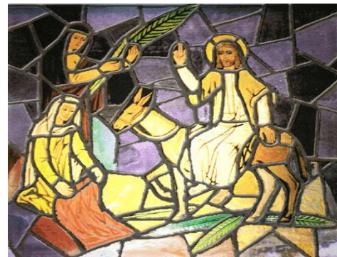
Holy Week Schedule St. David’s Episcopal Church

There’s a lot to do to make this wonderful event happen, from setting up the fellowship hall for the meal, cooking or providing the food, and of course, clean up. Food preparation includes roasting the lamb, making hard boiled eggs, baked potatoes, and some strange sounding but delicious dishes such as haroset, tsimmes, and kugels. Food to be purchased includes kosher wine and grape juice, parsley, matzo, horseradish root and prepared horseradish, and gefilte fish. Jody’s got this well organized and broken down in small and big tasks. We expect about 40 people, so each task can be shared. If you would like to help, please sign up on the sheet on the back table in the church, or talk to Jody if you’re not sure what you can do. And if you can’t cook or help with set up, but still want to come, please do.